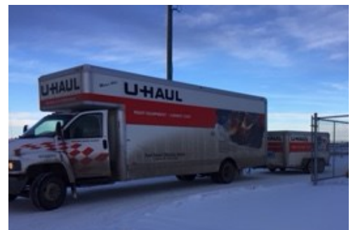
U-Haul loaded with donated beds & furniture