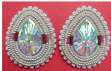
Beaded Earring By Katelyn Wildcat